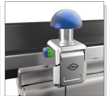
535-1760 Extra pan handle Extra pan handle allows panning the table from different sides.