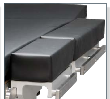
514-100422 Widening sections (pair) Side rail mounted side extensions, length 455 mm, with mattresses for lateral positioning of the patient. Other dimensions available upon request. Recommended with side rails 535-1721 or 535-1720.