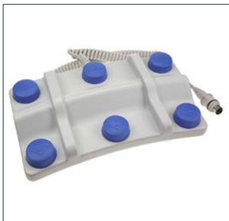
535-1762 Foot control Compact multipedal footswitch for discrete placement beneath the table with soft touch buttons and a light operating force.