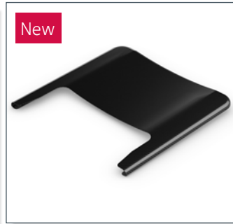
535-1745 3D Head rest / extension Carbon fiber head rest / extension that extends the radiolucent length with 30 cm (11.8”).