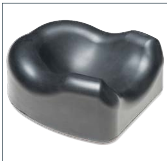
514-100334 Head cushion Cushion to stabilize the patient's head during procedures.