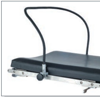
514-100311 Anesthesia frame Enables hanging cloths or equal material to differentiate the sterile zone from the non-sterile zone.