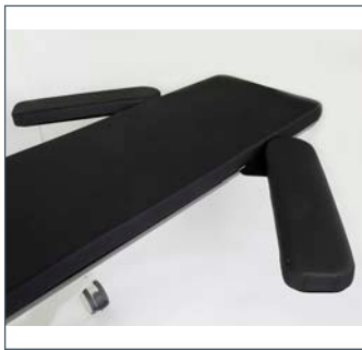
505-1110 Dual arm board Radiolucent dual arm board for supporting the patient's both arms.