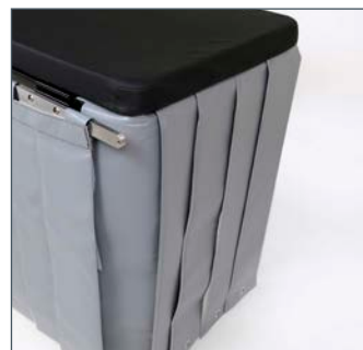
535-1770 X-ray protective kit (grey) Tailored and easy to fit protection against scattered radiation with lead rubber (0.5 Pb) material. For detailed information please see our brochure for Radiation Shields.

Also available in 500 mm (535-1752) and 1,500 mm (535-1751).