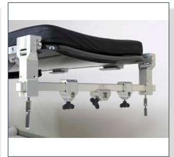
514-3011-00 DORO® Side Rail Adaptor Amsco Side rail mounted adaptor for DORO Headrest (non-radiolucent).