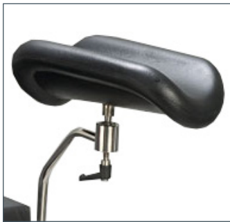
514-50-3SR032 Leg holders (pair) Leg holders Goepel type with clamps.