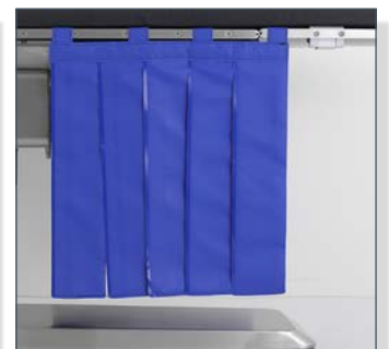
535-1773 X-ray protective loop (blue) Tailored and easy to fit protection against scattered radiation with lead rubber (0.5 Pb) material. For detailed information please see our brochure for Radiation Shields.

Also available in grey (535-1772) and as single panels to attach directly to the table top using Velcro strips (blue: 535-1774, grey: 535-1773)