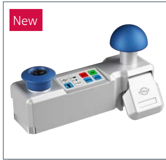
535-1765 Integrated control module Combines the essential table control functions from the hand control and the pan handle into one device.

Products may not be available in all regions. Please contact your STILLE-representative for more information on market availability.