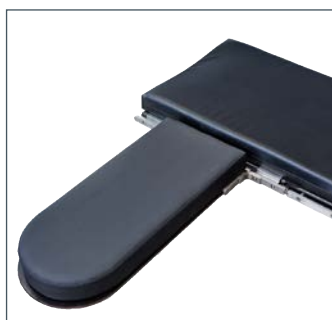
535-1730 Radiolucent fistula arm board Provides an unobstructed image and is connected directly to the carbon fiber top for Vascular procedures.

Also available in grey (535-1772) and as single panels to attach directly to the table top using Velcro strips (blue: 535-1774, grey: 535-1773)