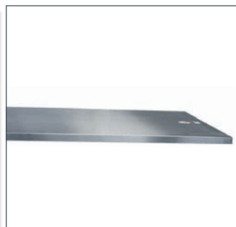
535-1750 Catheter tray 1,000 mm Provides an extended work space, which is attached directly to the table.

Also available in 70 cm (EU: 535-1729, US: 535-1723) and 28.5 cm (EU: 535-1725, US: 535-1724).