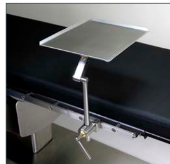
514-50-3SR036 Adjustable tray with clamp Adjustable tray to place instruments and other important devices useful to the surgical team