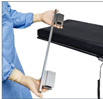
535-1721 Detachable side rail (80.5 cm) Side rail enabling full table length side rails for accessory mounting. Not compatible with Adjustable head rest.