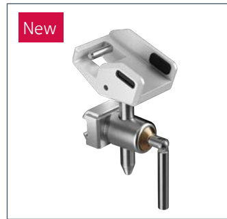
514-50-3SR040 Hand control holder Holds hand control in 20° angle to provide one hand operation of the function buttons.