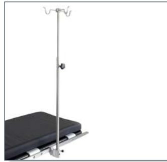
514-100401 IV-pole Infusion pole with clamp for side rail fixation.