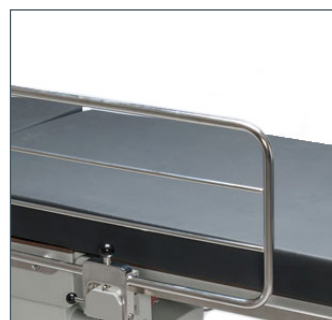
514-100530 Side gates, foldable (pair) Side rail mounted gates to ensure the patient's safety and comfort during ERCP procedures. Recommended with side rails 535-1721 or 535-1720. US-version: 514-100530-US.