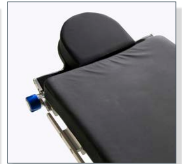
535-1742 Adjustable procedure headrest Fully radiolucent headrest, ensures easy intubation and superior carotid visualization. It fits both ends of the table and does not require side rails.