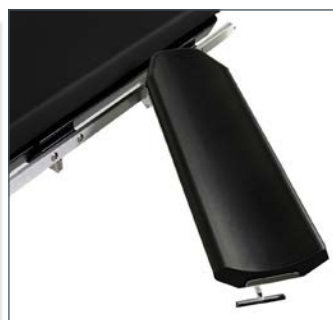
514-50-3SR025 Adjustable arm board Nonradiolucent board provides ideal support for the patient's arm during IV. US-version: 514-50-3SR027.