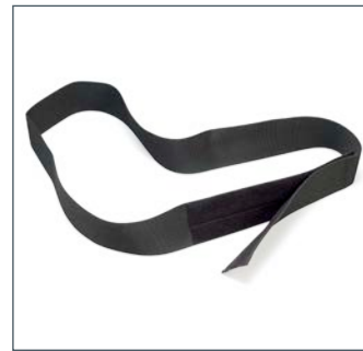
514-100465 Body/leg strap Strap to fix the patient, to be fixed to the side rails by Velcro.